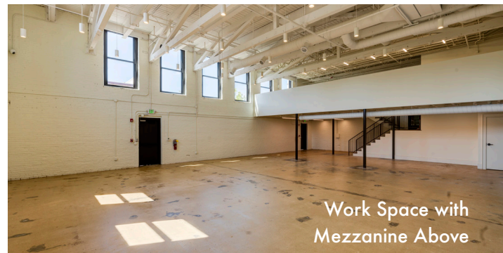
Work Space with Mezzanine Above