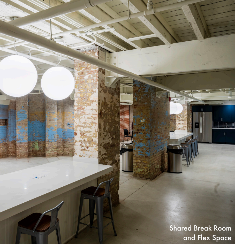
Shared Break Room and Flex Space