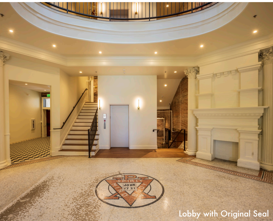
Lobby with Original Seal